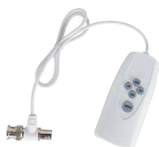
PFM820 UTC Controller