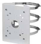
PFA150 Pole mount