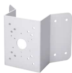
PFA151 Corner mount